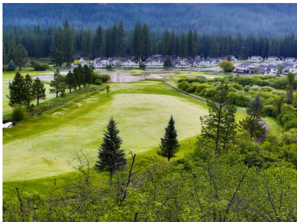
9th Fairway with the Villas in the background