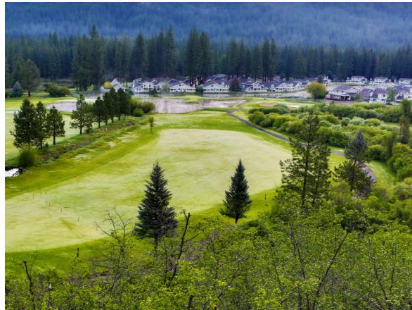
9th Fairway with the Villas in the background