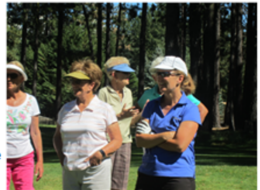
Last Year's Invitational Players Enjoying a Beautiful Day

I can't wait to get back out there, having sat out for the winter, but there is no excuse for you snowbirds not to show us all how it's really done. Let's get out there to play and make friends!